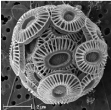
Scanning electron micrograph of Emiliana huxleyi, an example of a marine micro-organism that uses calcite to make highly elaborate 'designed' surface structures. These nanostructures, which have a diameter of two millionths of a metre, are engineered from a material that human designers find difficult to work with. Further, they are fabricated precisely and rapidly even at low temperatures.