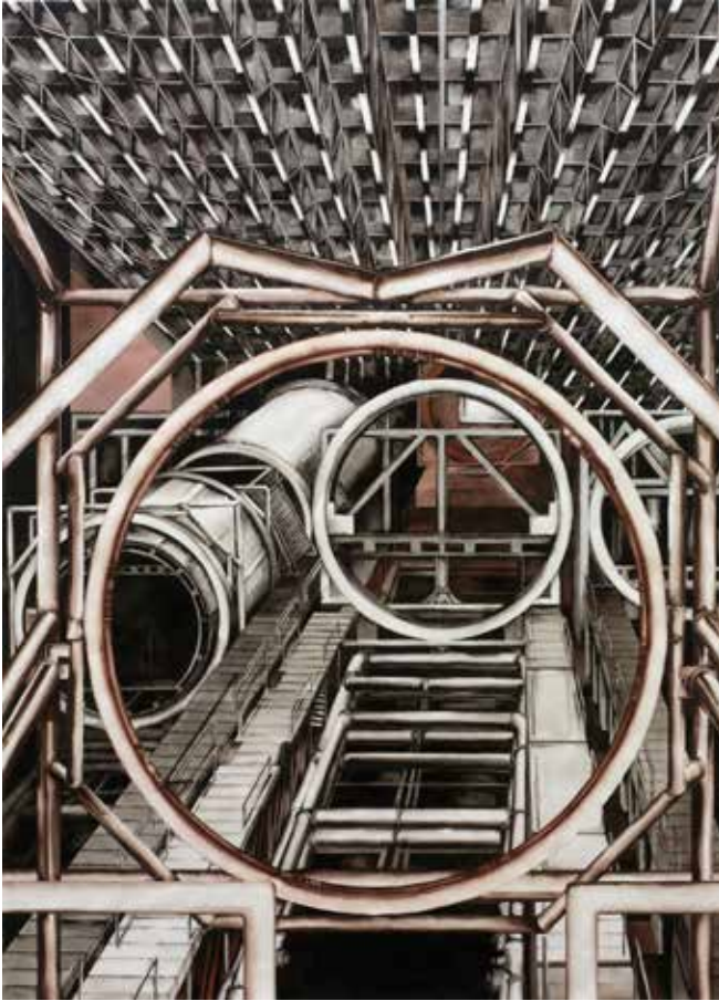
Boeing Assembly Plant, Seattle, 1989, 149.2 x 108.7 cm, pen, ink and wash on paper. The Imperial War Museum London. Commissioned by the Artistic Records Committee of the Imperial War Museum, 1989.

Deanna Petherbridge is an artist, writer, and curator primarily concerned with drawing. Her book, The Primacy of Drawing: Histories and Theories of Practice , was published in 2010 by Yale University Press. Formerly Professor of Drawing at the Royal College of Art, London, she is Professor Emeritus, University of the West of England, Bristol. Her curated exhibitions include The Primacy of Drawing: An Artist's View (1991), The Quick and the Dead: Artists and Anatomy (1997), and Witches and Wicked Bodies , National Galleries of Scotland, Edinburgh (2013), currently showing at the British Museum, London until 2015. She was an International Scholar at the Getty Research Institute in Los Angeles 2001–2, has lectured internationally and undertaken residencies and study tours in Britain, Europe, USA, India, Singapore, Pakistan, Malaysia and Australia. Her drawings are in major British collections and she writes regularly on art and architecture in popular and scholarly journals.