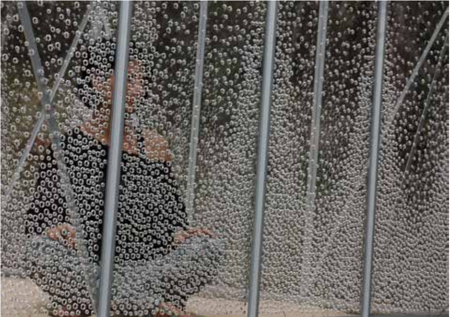
The Liquid Air (Prototype), 2013, 204 x 192 x 206cm; aluminium, perforated acrylic sheet, sand; installation view, Sydney. Photo: Ainslie Murray.

Ainslie Murray is an interdisciplinary artist, architect, and academic working principally in painting and installation. Her work explores the augmentation of architectural space through subtle realisations of intangible, hidden, and forgotten spatial forces. The air of architectural space, the choreography of the body, and the repetitious rituals of the construction process each find a focus in her work. The two and three-dimensional works may be considered as active architectural spaces, where undulating surfaces draw attention to both artefact and process, and evidence sequences of conception, assembly and inhabitation. Ainslie was awarded her PhD in Visual Arts from the University of Sydney, and teaches a wide range of interdisciplinary architectural design and communications studios in the Faculty of the Built Environment at the University of New South Wales.