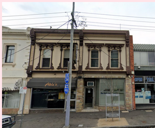
109 Elgin St, Carlton VIC 3053

The conference dinner will be at Abla's. Abla's is a one km walk from the Babel building.